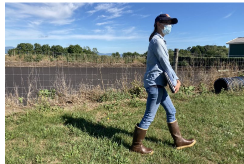
Above: A VAAFMM Water Quality Specialist assesses areas adjacent to a manure pit during an inspection.